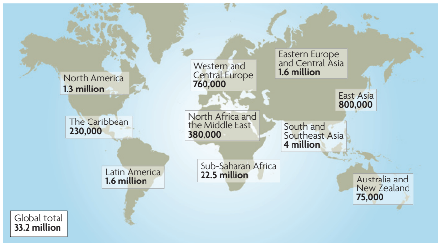
Figure 1 | Estimated number of adults and children living with HIV in 2007. The figure was compiled using data provided by the WHO/UNAID (2007), see Further Information for details.

at reducing the rates of HIV infection 12,13 . An effective vaccine against HIV might have to stimulate multiple immune effector responses, not just antibody or T-cell responses. Although there was a great deal of optimism early in the HIV/AIDS epidemic that a vaccine would be available quickly, there is now a realization that an effective vaccine might take a decade or more to develop.